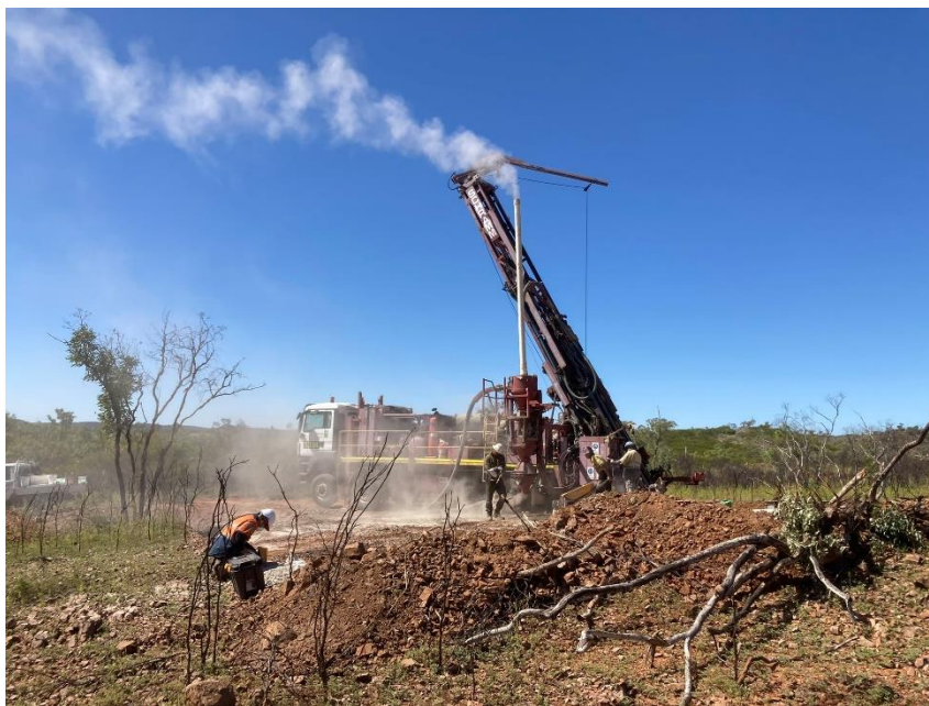
Plate 1: RC Drilling at King Solomon Prospect May 2022

"It's great to have started our maiden drilling program at the Mt Isa East Cu-Au Project. The targets at King Solomon and Python look very promising with extensive historical workings, broad geochemical signature and FLEM responses to drill test as part of this program. The VTEM survey screening of a large part of Cooper's tenure will commence next week, we look forward to updating the market as results come to hand."