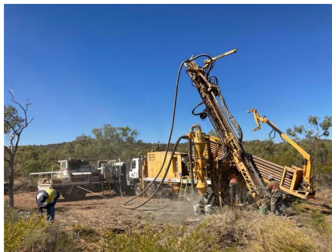
Plate 1: RC Drilling at King Solomon Prospect July 2022